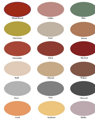
ColorBlend™ Shake-On & Stain Surface Colors Stamp Release Agent

Custom Colors Available Actual colors in the field may slightly vary from these printed samples